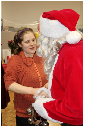
Telling secrets to Santa!