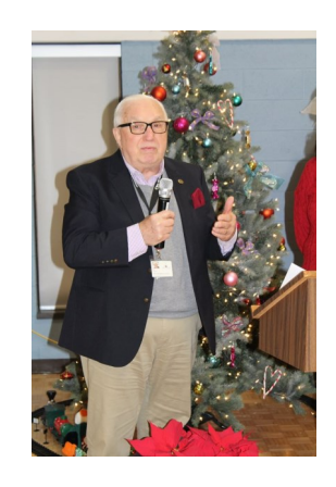
Kitchener Ward 3 Councilor John Gazzola