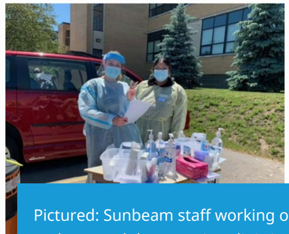
Pictured: Sunbeam staff working our early second dose vaccine clinic in June 2021.

On behalf of everyone in the Sunbeam Community, I invite you to reflect on and celebrate the amazing power of community in enriching the lives of the people we support. And here’s looking forward to a positive and uplifting future with much hope, supporting our community for many more years to come!